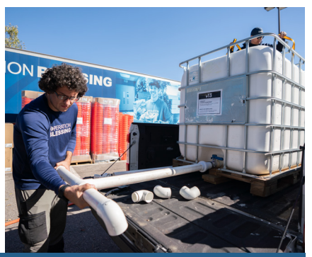
Operation Blessing's response included delivering relief goods by air, like water purifiers and food boxes, and installing water tanks.

Thanks to your support, we were able to partner with Air Mobile Ministries and used a helicopter to reach an area along the river where homes were isolated due to road closures. We delivered emergency food boxes and other critical supplies. "This is the first organization that's been on this side of town," Melissa, one of the residents, told us.