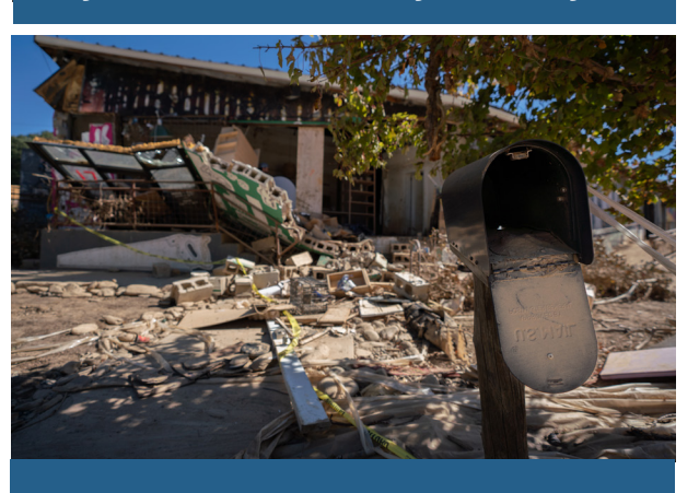
We are restoring livelihoods in the devastated arts district and rebuilding 175 homes!